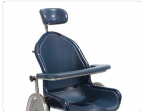
Anatomically moulded seat pan with extremely good side guides for stabilisation of the upper body. Two-part insert pad for additional sitting comfort