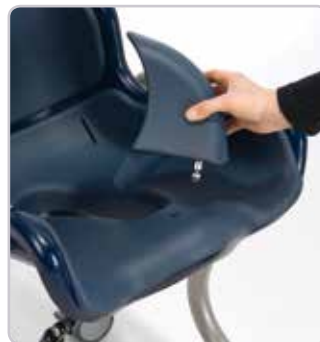
Plug-in spray protection available in two sizes