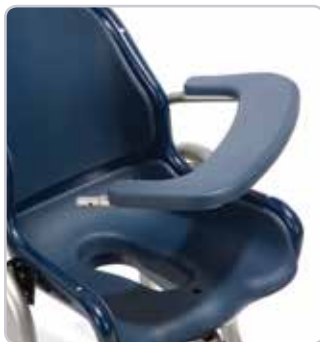
Plug-in arm support for stabilisation and for keeping the upper body upright