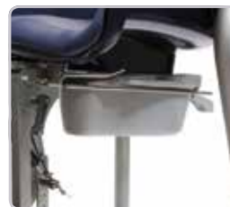
Practical toilet arrangement