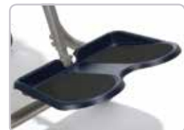
Foldable and angle adjustable foot support made of high-quality ABS material