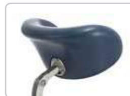
Height and angle adjustable head rest for support of head control